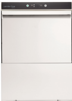
centerline by HOBART

that a commercial dishwasher brings to the clean-up process is a significant advantage.