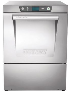
advansys ™ LXeR

THE PERFECT HOBART UNDERCOUNTER IS WAITING. CONTACT US TODAY TO LEARN MORE.